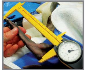
Joey foot measurement.

Tail Length: Underside from the base to the tip (excluding any hair protruding from the tip). Measured with a ruler or tape measure.