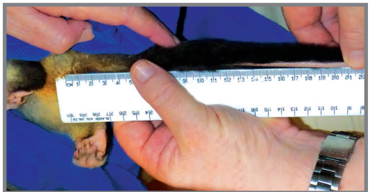
Possum tail measurement.